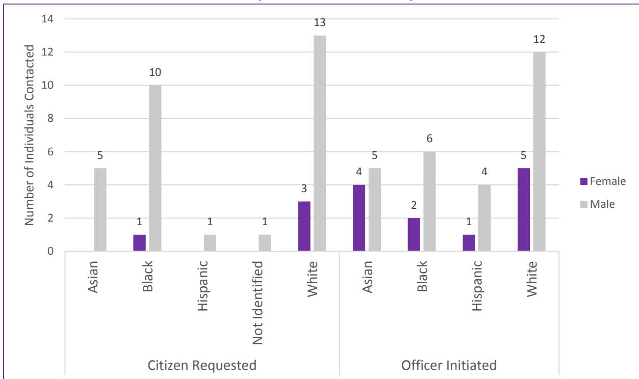
Northwestern University Police Department Evanston Campus Fourth Quarter 2016 Field Stop Data Call Initiation Type and Self-identified Race and Gender October 1, 2016 - December 31, 2016