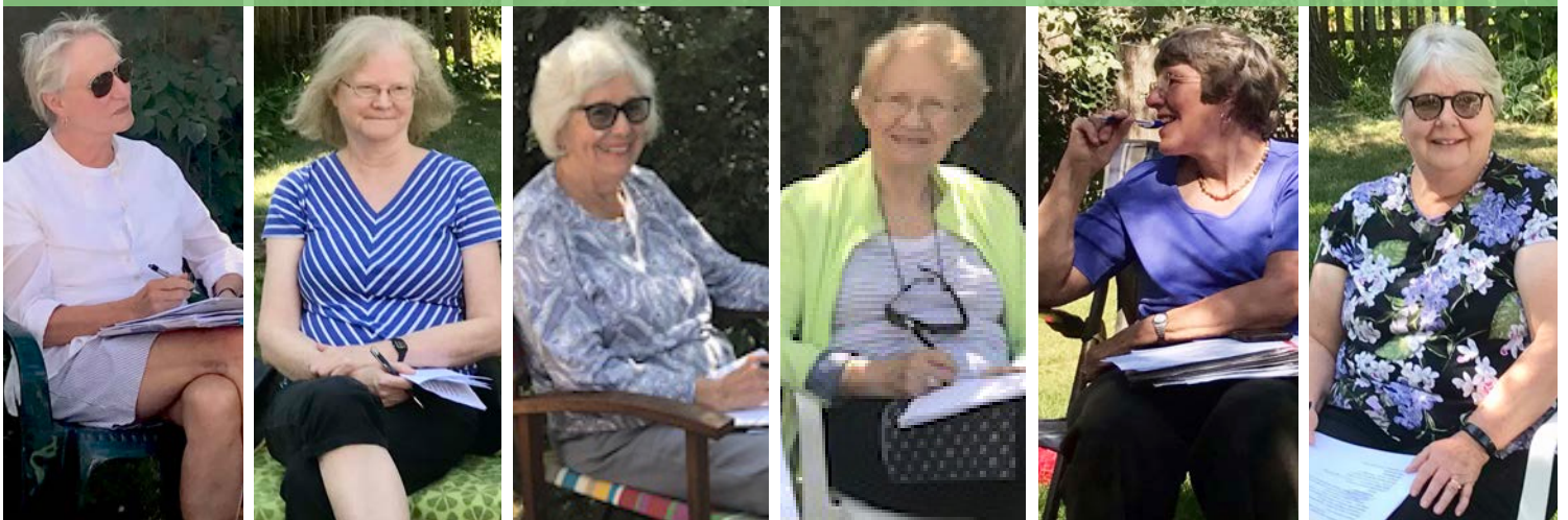
Circle executive board meeting outdoors on a warm September day.