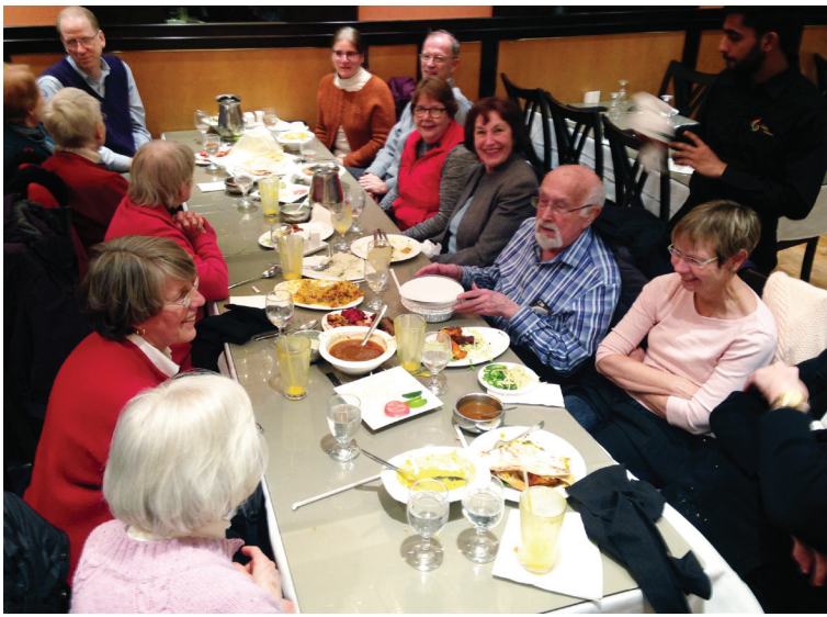
Circle diners share a meal at Sabri Nihari.