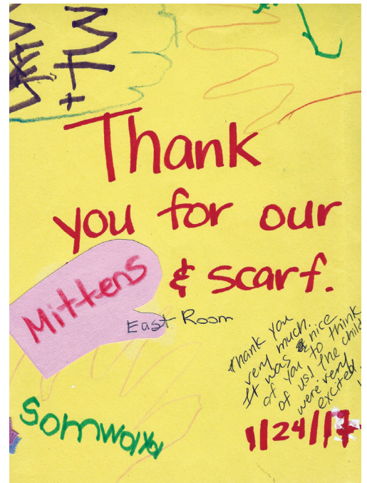
Settlement kids say "Thanks!"

The evening's concert featured two pieces by French composers in addition to the double violin concerto. The Northwestern student orchestra played with great understanding of detail and nuance under Yampolsky's baton, and more pointed energy than the Chicago Symphony often exhibits. It was obvious these young performers were prepared to play in major orchestras of the world.