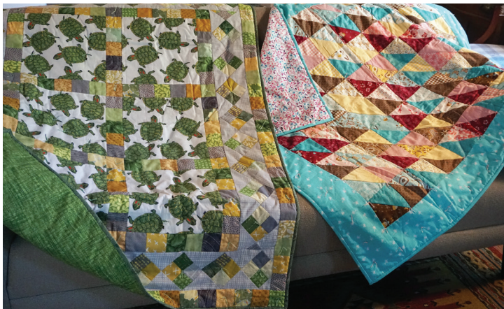
Above: Quilts featuring fanciful turtles and lively triangles stir the imagination.