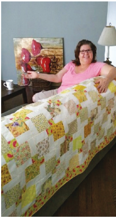
YWCA Apartments resident with her Piecemakers quilt.