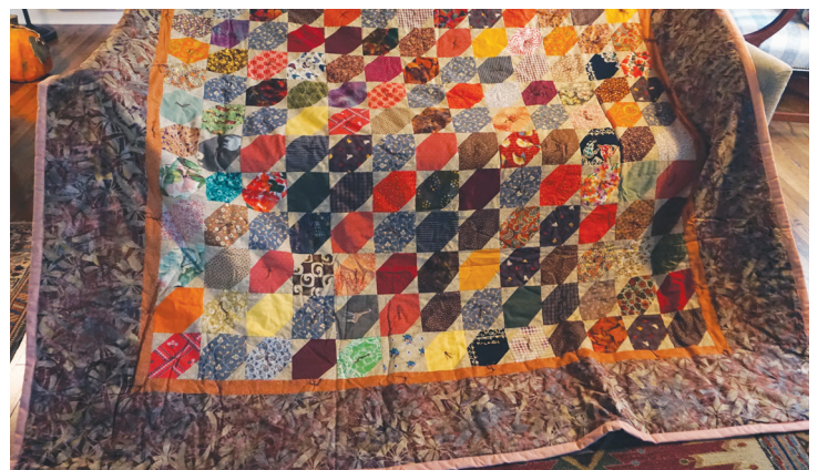
Below: What do you see, stretched stars or hexagonal jewels?