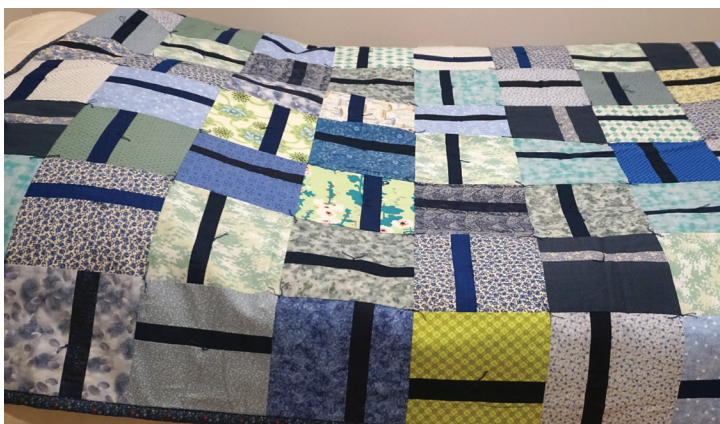
Below: Grid pattern quilt doubles as a mat for building a play town.