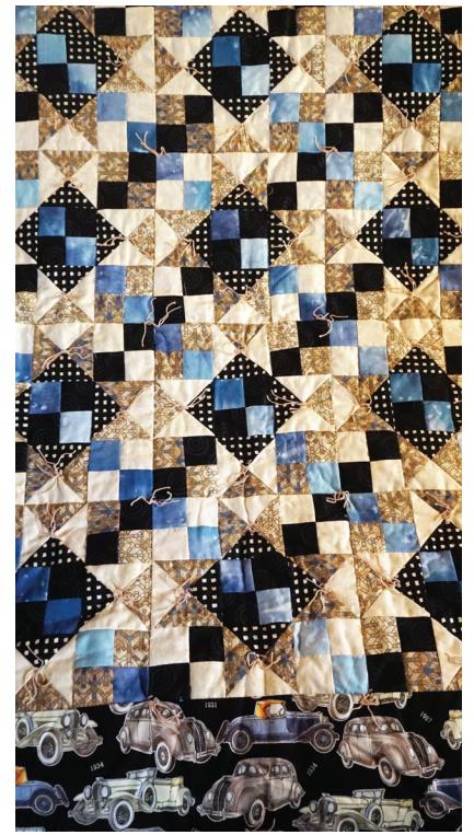
Star blocks set off with border of vintage vehicles.

The photo on the left offers heartwarming evidence of their mission accomplished.