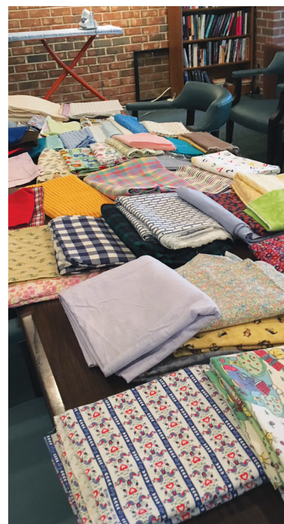
Stacks of flannel fabric to be cut and pieced into baby blankets.