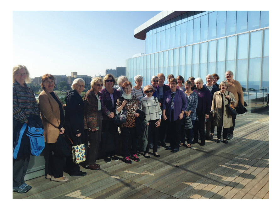
Sunlight streams down on Circle members as they tour the Global Hub.