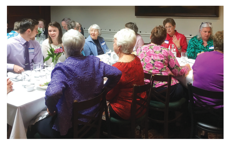
Circle members, scholarship winners and guests enjoy the meal.