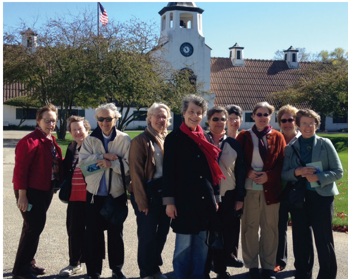
In front of the main barn at Crab Tree Farm