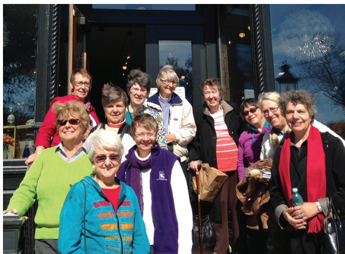
After lunch at Wisma's in Lake Bluff