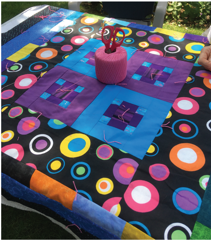
One of 36 quilts that Piecemakers will donate to children and families.