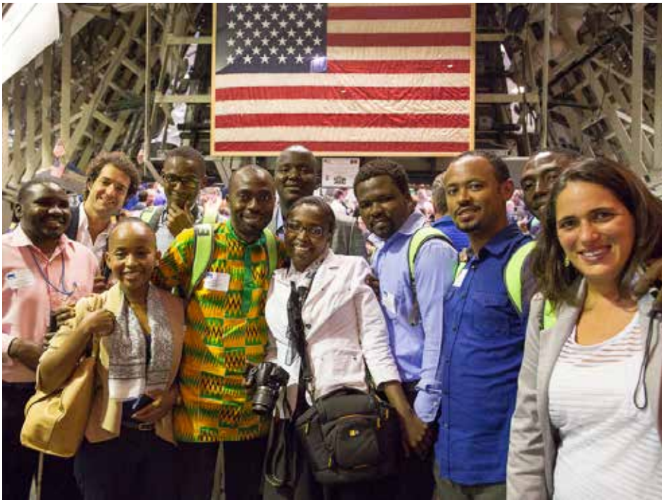
Left, Northwestern hosted 25 scholars in the Obama administration's Young African Leaders Initiative in 2014 and will continue to be a program host during the next four summers.