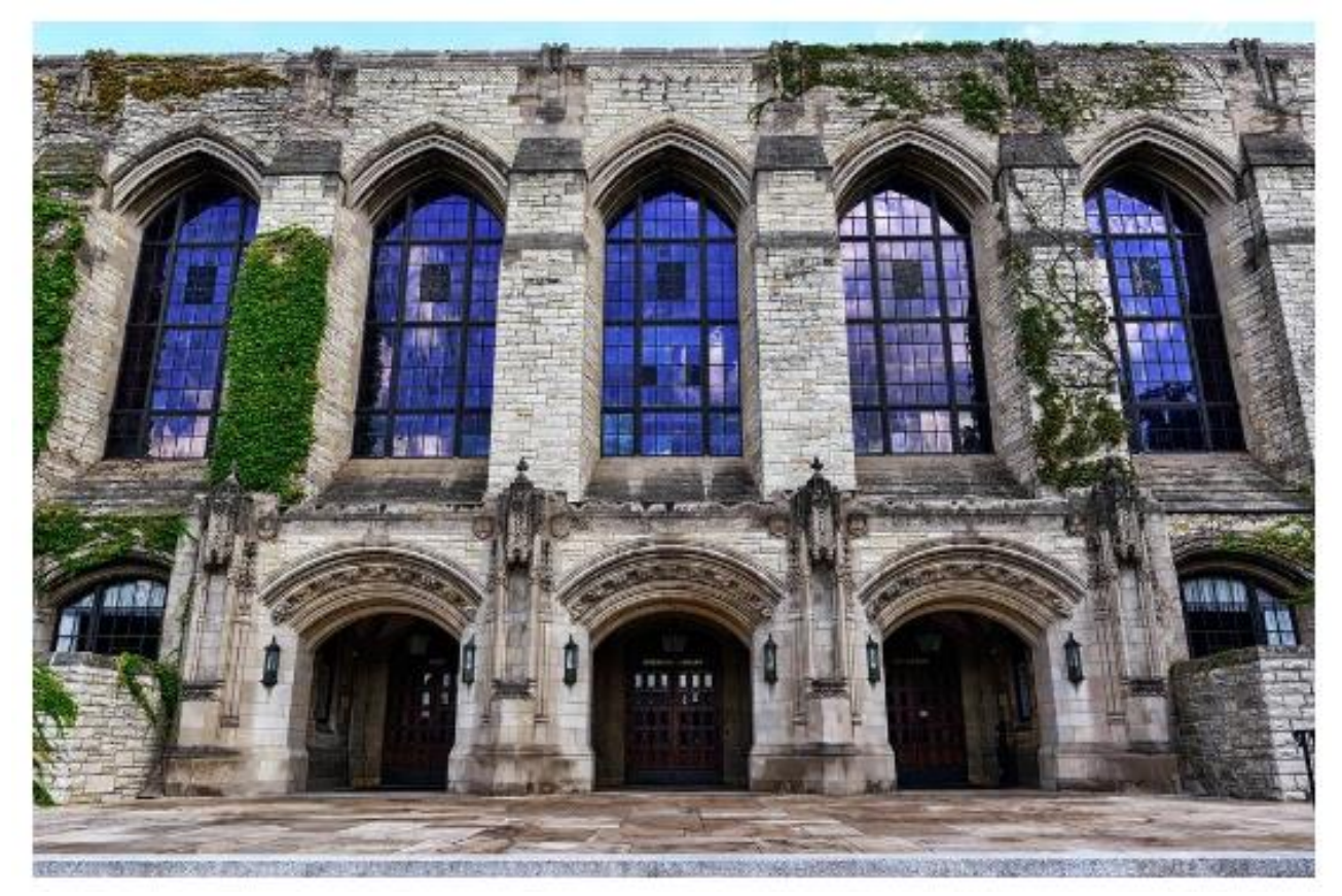
Northwestern's president believes people need to feel safe to voluntarily engage in uncomfortable learning.

It isn't about coddling students. It's about creating an environment for learning