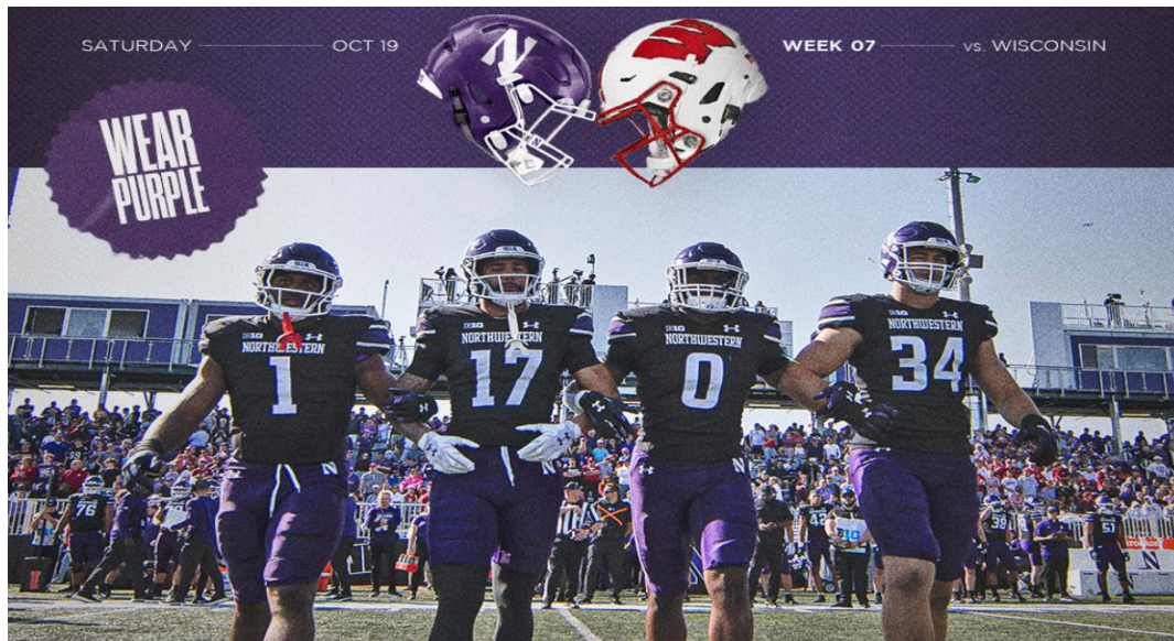
Northwestern vs Wisconsin

Are you a sport fan? Do you know Northwestern's fascinating top sport lacrosse? Are you hoping sports become one of the things making your life exciting? Keep your eyes on the calendar ( https://nusports.com/calendar ) and news ( https://nusports.com/ )! Wear Purple to show your support!