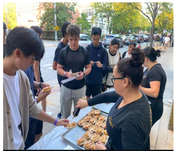
Students taking bites from Frida's restaurant on Big Bite Night.