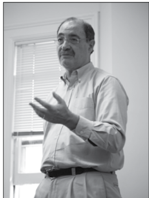
Charles F. Manski

As the evidence accumulates, you could modify the fractions. So in the beginning when you don't really know, maybe half the schools get one policy and half get the other. As the data accumulate and it looks like one policy's working better than the other, you go from 50/50 to 60/40 to 70/30, and then when you finally feel comfortable enough that one policy is really the best, then everyone gets that policy.