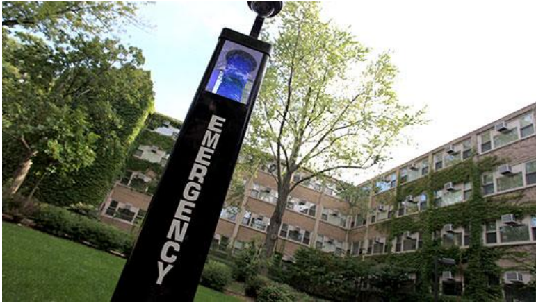
Emergency Blue Lights Blue Light Telephones