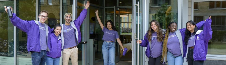
GRAs/Hall Staff on Duty