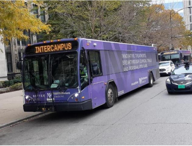
NU Shuttle Campus Shuttle