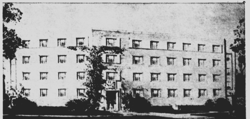
NEW WOMEN'S DORM, Shepard hall, will be built on circle across from present west quad as memorial to university's youngest dean of women.

Mostly fair and warm today. High, 80 degrees. Low, 60 degrees. Southerly winds 10 to 15 miles per hour.