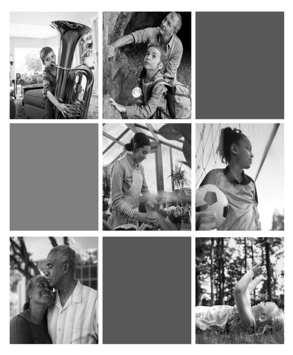
Your Health Care Benefits Program