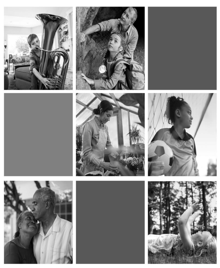
Your Dental Care Benefits Program