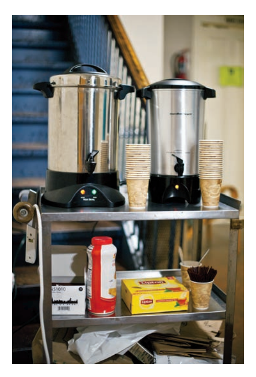
Evanston's emergency overnight shelter, which opens when the temperature falls below 15 degrees, is supported by volunteers and a full-time staff supervisor.

Along with Interfaith Action, Connections provides a broad range of support. Founded in