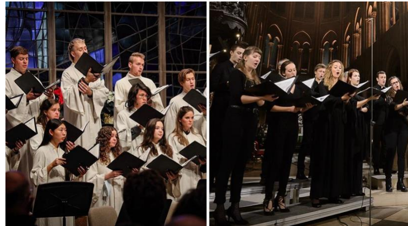
Litanies à la Vierge Noire (Litany to the Black Virgin), and the Requiem of Gabriel Fauré. The Alice Millar Chapel Choir offers American choral gems and joins the Notre Dame Choir in Fauré's Cantique de Jean Racine .