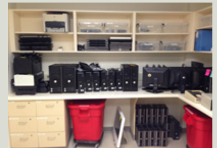
A selection of Dell computers that are currently for sale on the Surplus Property Exchange.

The Surplus Property Exchange is an online bulletin board where Northwestern University departments can list surplus University property. At any given time there are a variety of NU-owned items for sale and for free. Visit the Surplus Property webpage and you can also sign up for the listserv and receive emails when items are posted to the site.