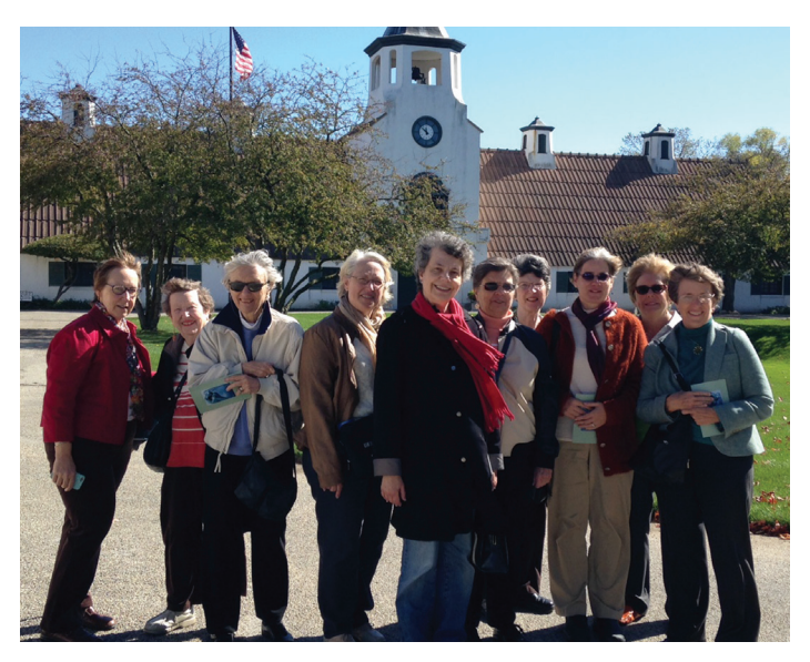
In front of the main barn at Crab Tree Farm

Circle members will supply donations of clothing, household