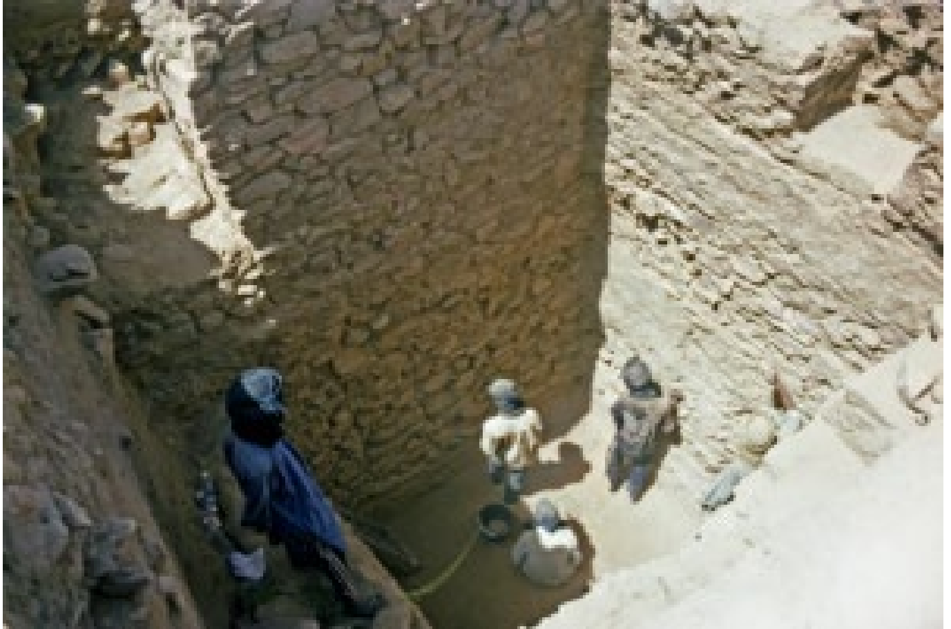
Looking down into excavation unit in Tadmekka from the surface; the image shows digging at depth of approximately 5 meters at the depth of the earliest walls recorded. Photograph by Sam Nixon, 2005