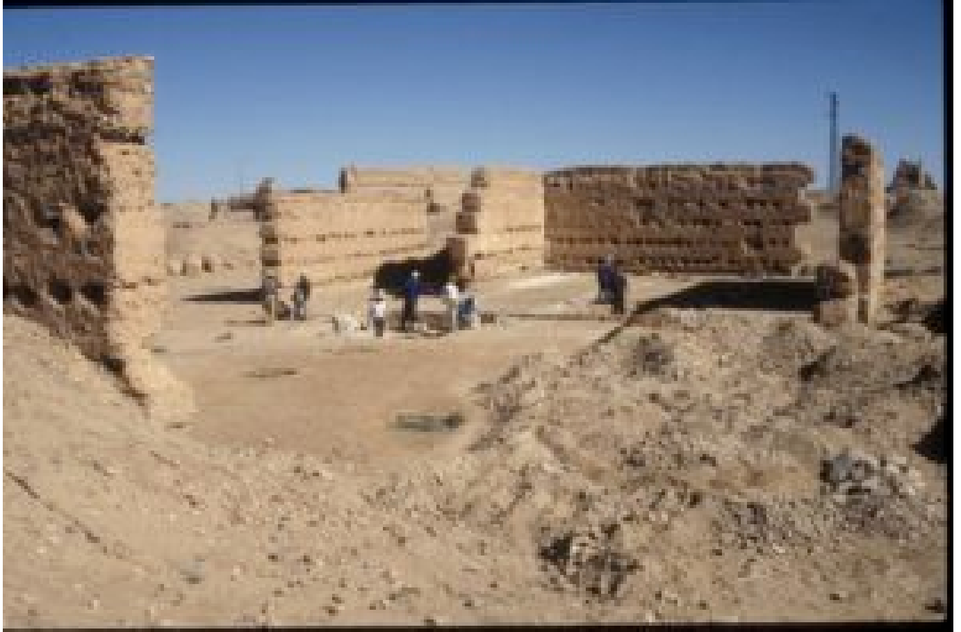
Excavations within the Sijilmasa mosque, with exposed walls from the “Filalian” period. Photograph by MAPS, 1996