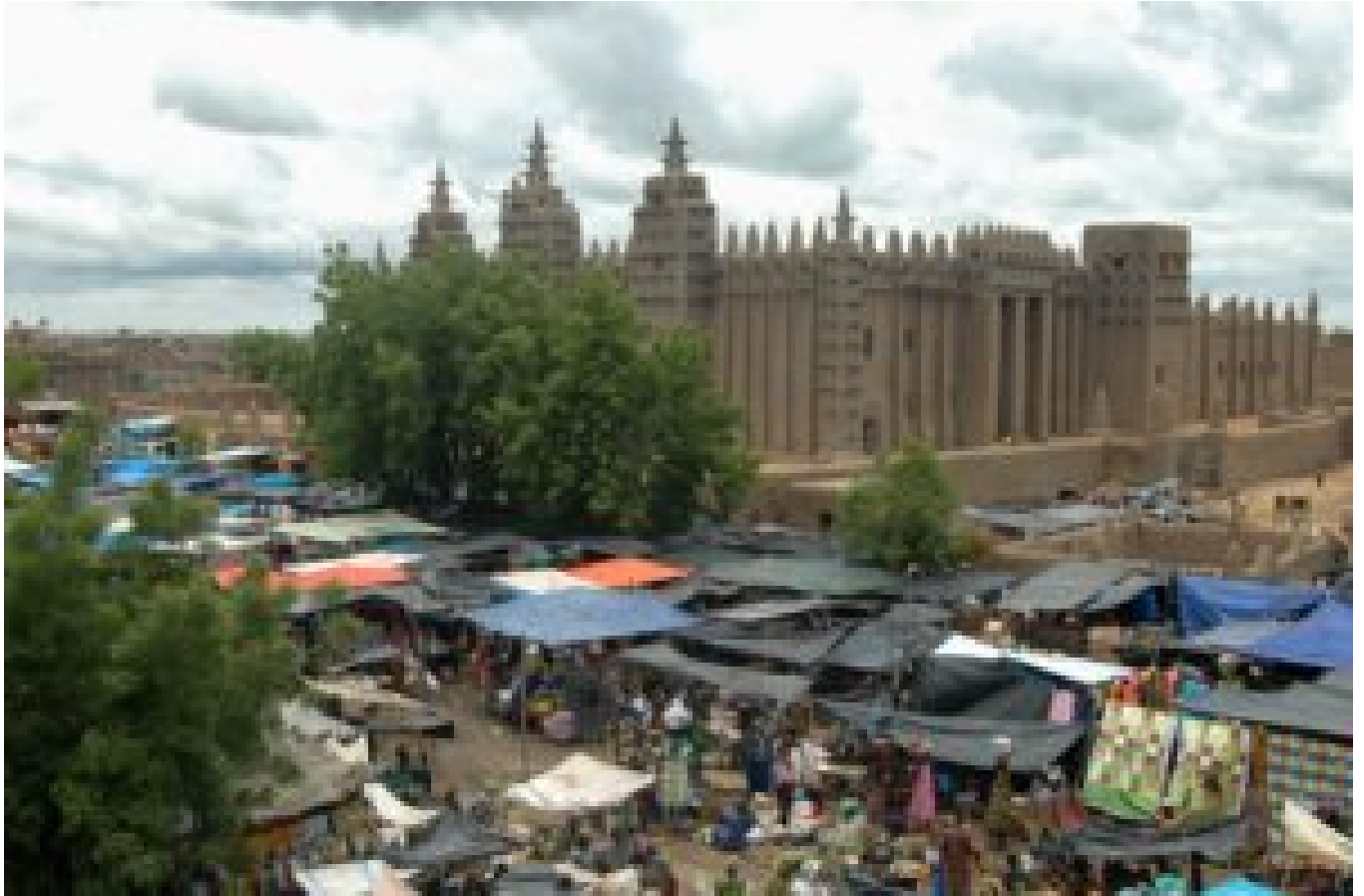
The great mosque of Jenne and the Monday great market, August 2013.

Section one, Groundwork , begins with an introduction sketching the urgent questions of history and the compelling themes that underlie this volume and the exhibition that was its impetus. This is followed by a provocative essay on fragments by the novelist, poet, and essayist Chris Abani.