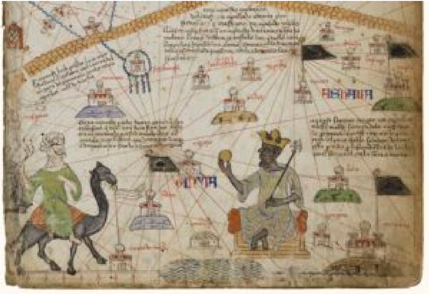
Atlas of Maritime Charts (The Catalan Atlas) [detail of Mansa Musa], Abraham Cresque (1325–1387), 1375, Mallorca. Parchment mounted on six wood panels, illuminated. Bibliothèque nationale de France.

camelback: “The region is inhabited by people who go heavily veiled, so that nothing can be seen of them but their eyes. They live in tents and ride on camels.”