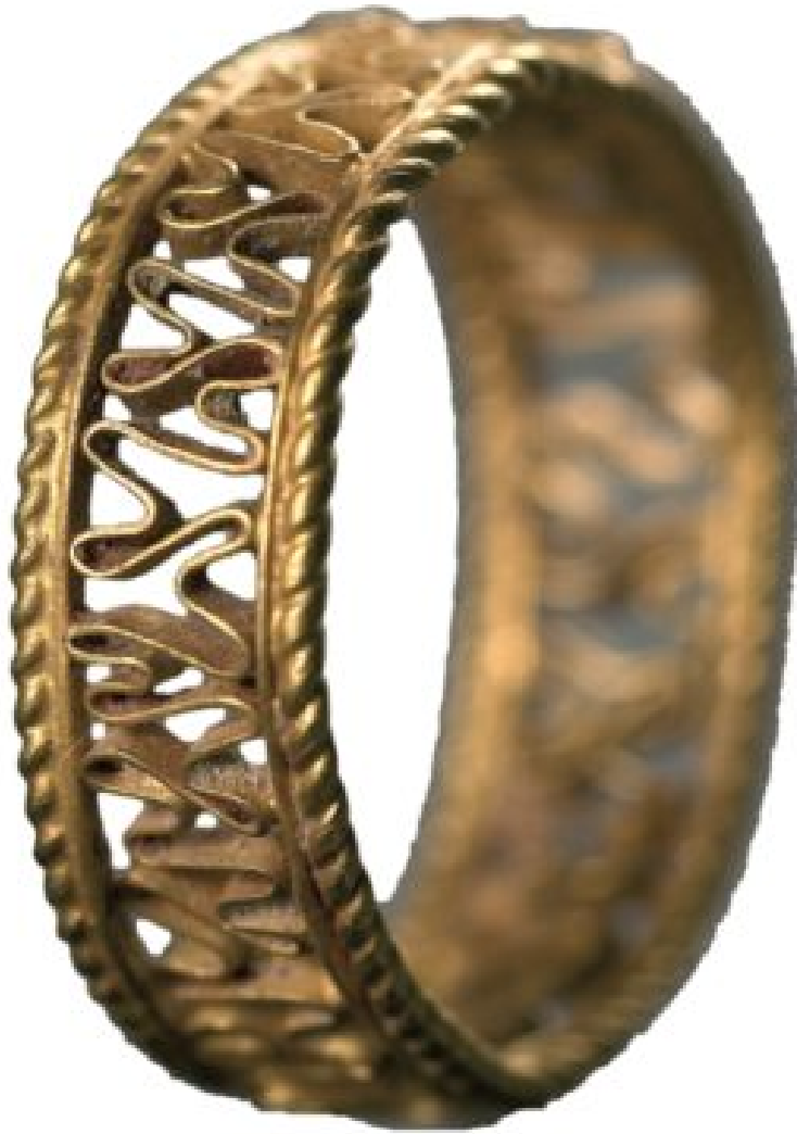
Ring excavated at Sijilmasa, Morocco, 9th/10th century. Gold, diameter 1.9 cm. Fondation nationale des musées du Royaume du Maroc, Rabat, 2006-1.

The motivation behind Caravans of Gold, Fragments in Time lies in the power of such fragments to move us from the concrete to the imaginable, a process that archaeologists call the archaeological imagination. It is touching and revelatory to comprehend that a stone monument was inscribed in Almería (Spain) and transported to Gao (Mali) to mark the grave of a deceased Muslim. Five inscribed monuments from Spain were recovered from the cemetery on the outskirts of the archaeological site of Gao Saney, all dating to the early twelfth century, when the Imazighen-led Almoravid Empire controlled territory extending from southern Spain to the Niger Bend. Al-Bakrī (d. 1094) tells us that Islam was well established in Kawkaw, the Arabic name for the kingdom of Gao, in the eleventh century, recounting, “the town consists of two towns, one being the residence of the king and the other inhabited by Muslims.” This stone