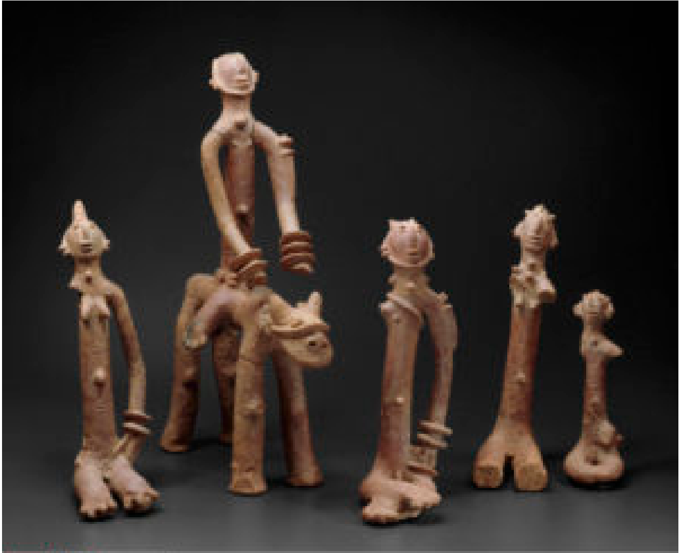
Horseman and Four Figures, Region of Bankoni, Mali, Terracotta, 13th/16th century (based on Thermoluminescence testing), Art Institute of Chicago.