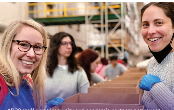
ARCC staff and community and academic partners network at Chicago's Bronzeville Winery (left) and volunteer at the Greater Chicago Food Depository (above).