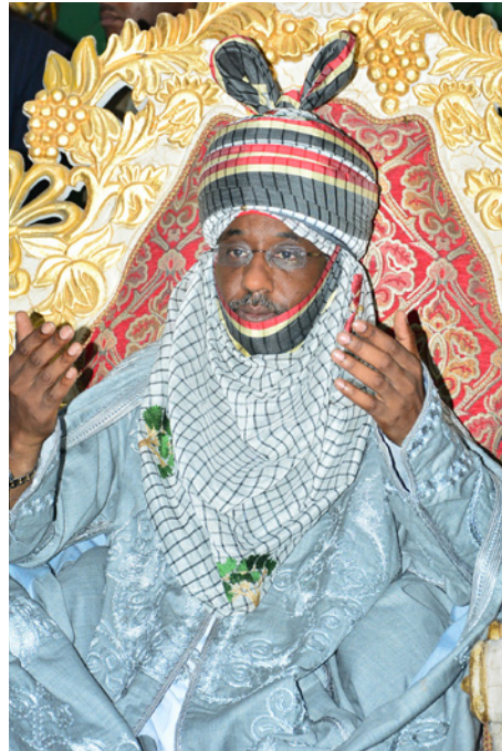
Emir Muhammad Sanusi II

As emir, Sanusi has continued to be an outspoken public figure. Northern