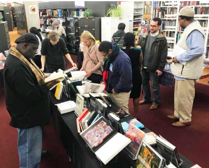
Visitors explore the "Africa and the Origins of Humankind" exhibit at the Herskovits Library.